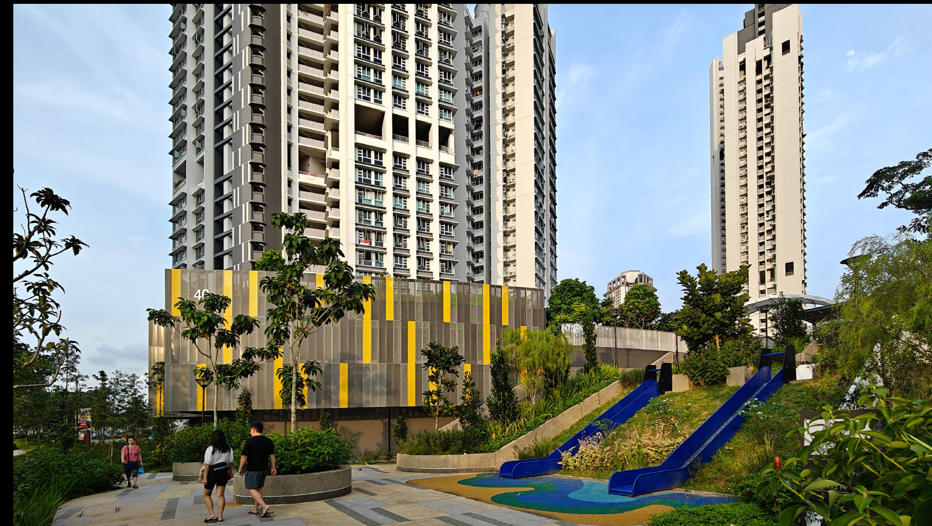
An adventure slope designed for children to enjoy