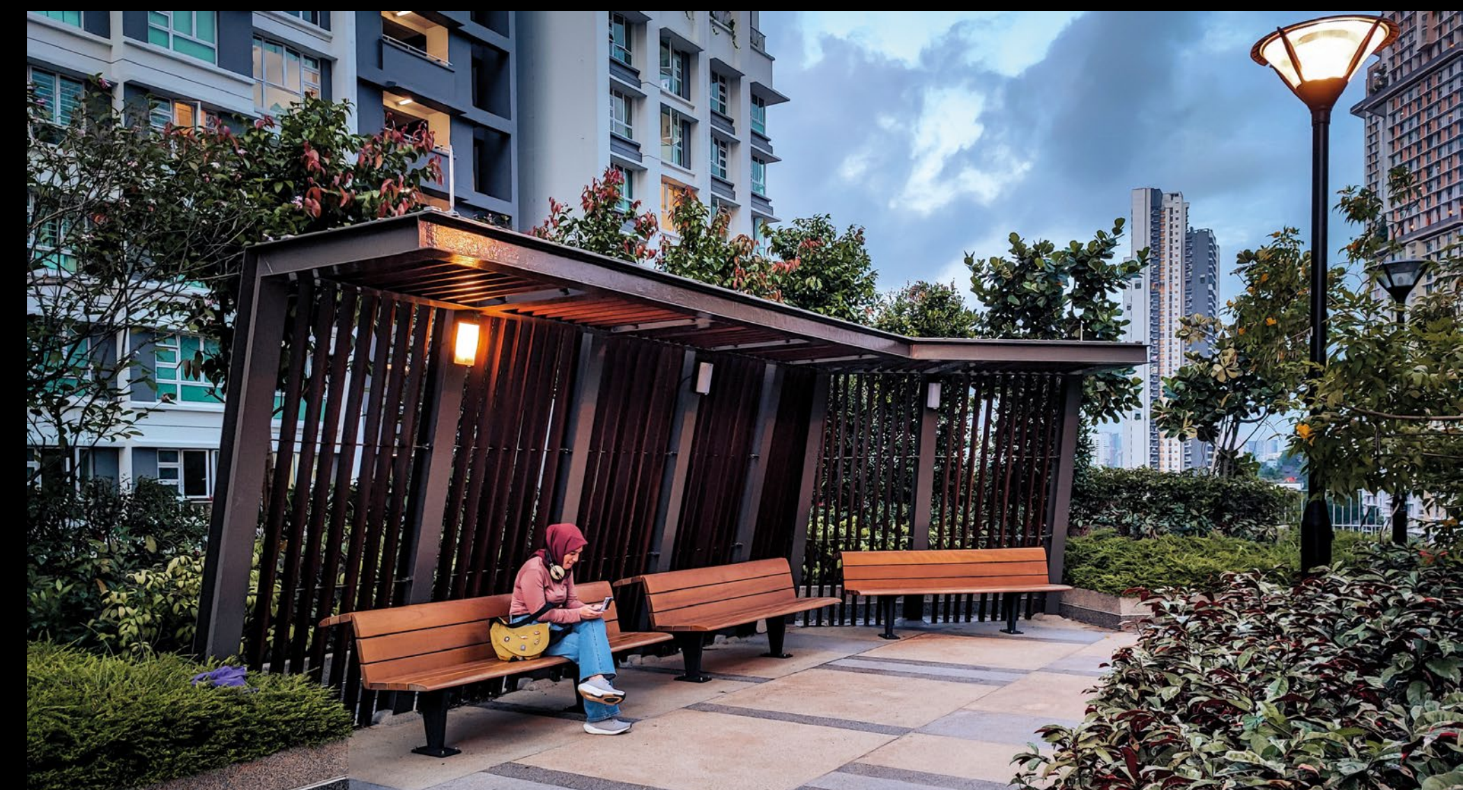
Relaxing space surrounded by lush greenery