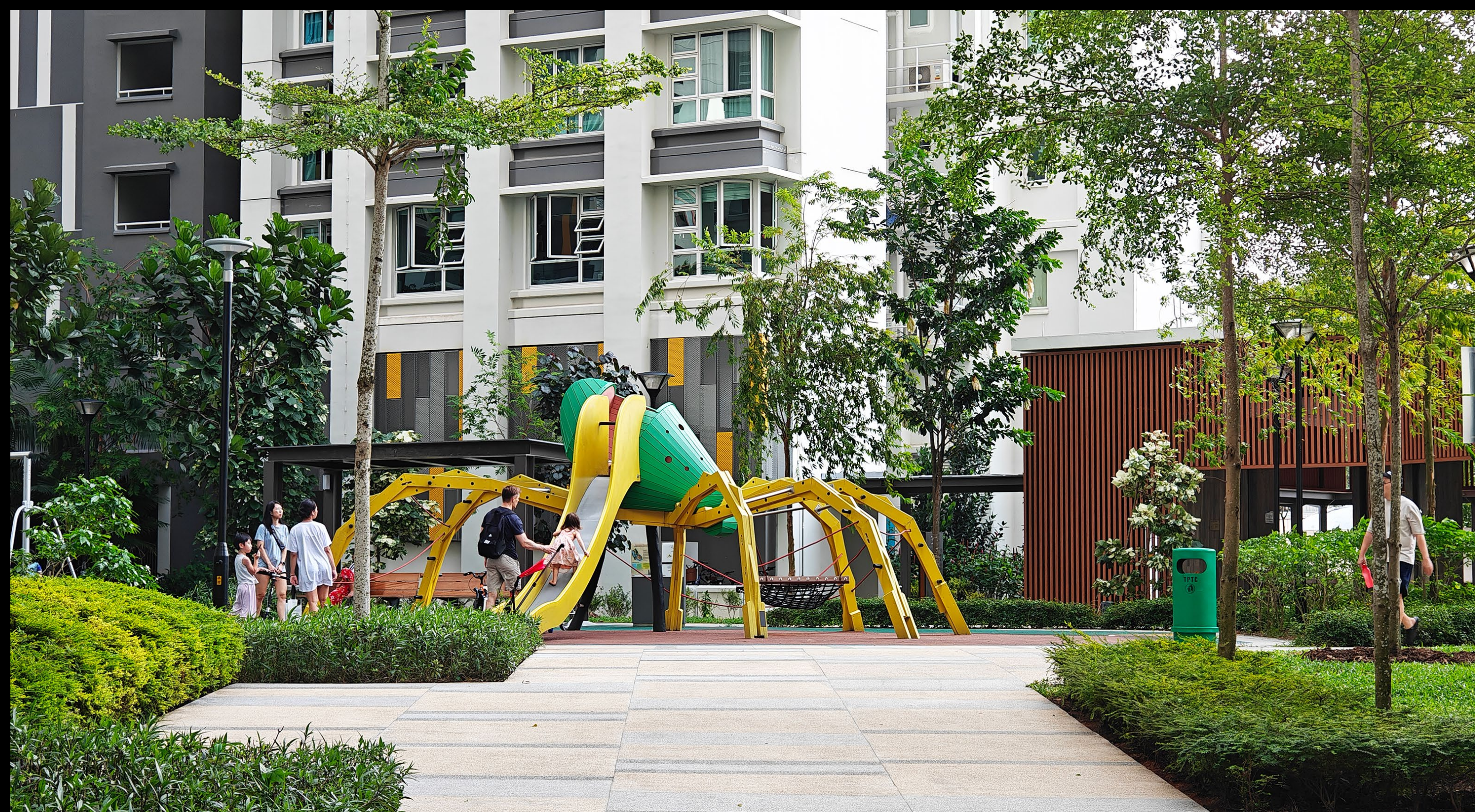
Central lawn with insect-themed multi-generational playground