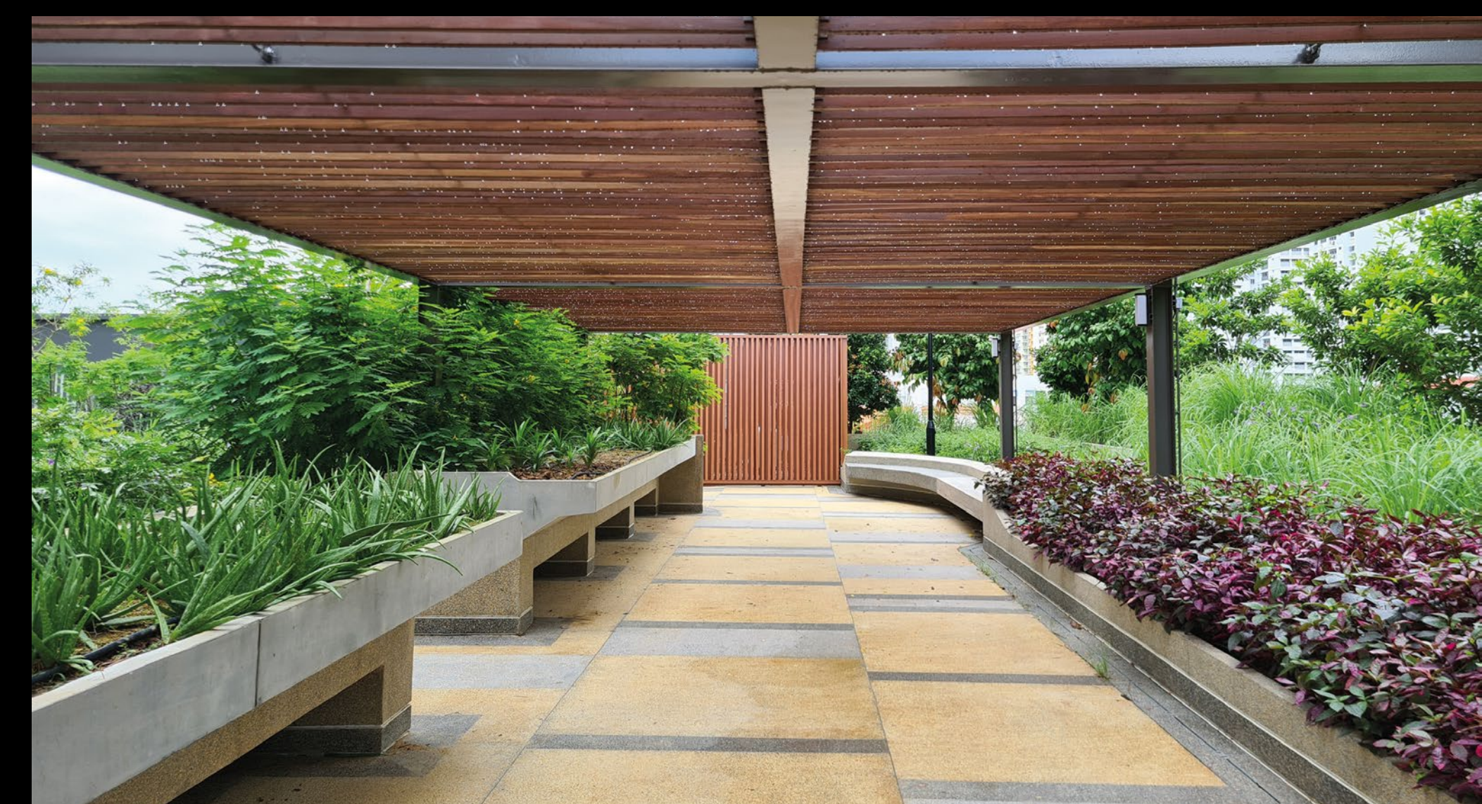
A community garden open to everyone, offering a therapeutic escape from the hustle and bustle of city life