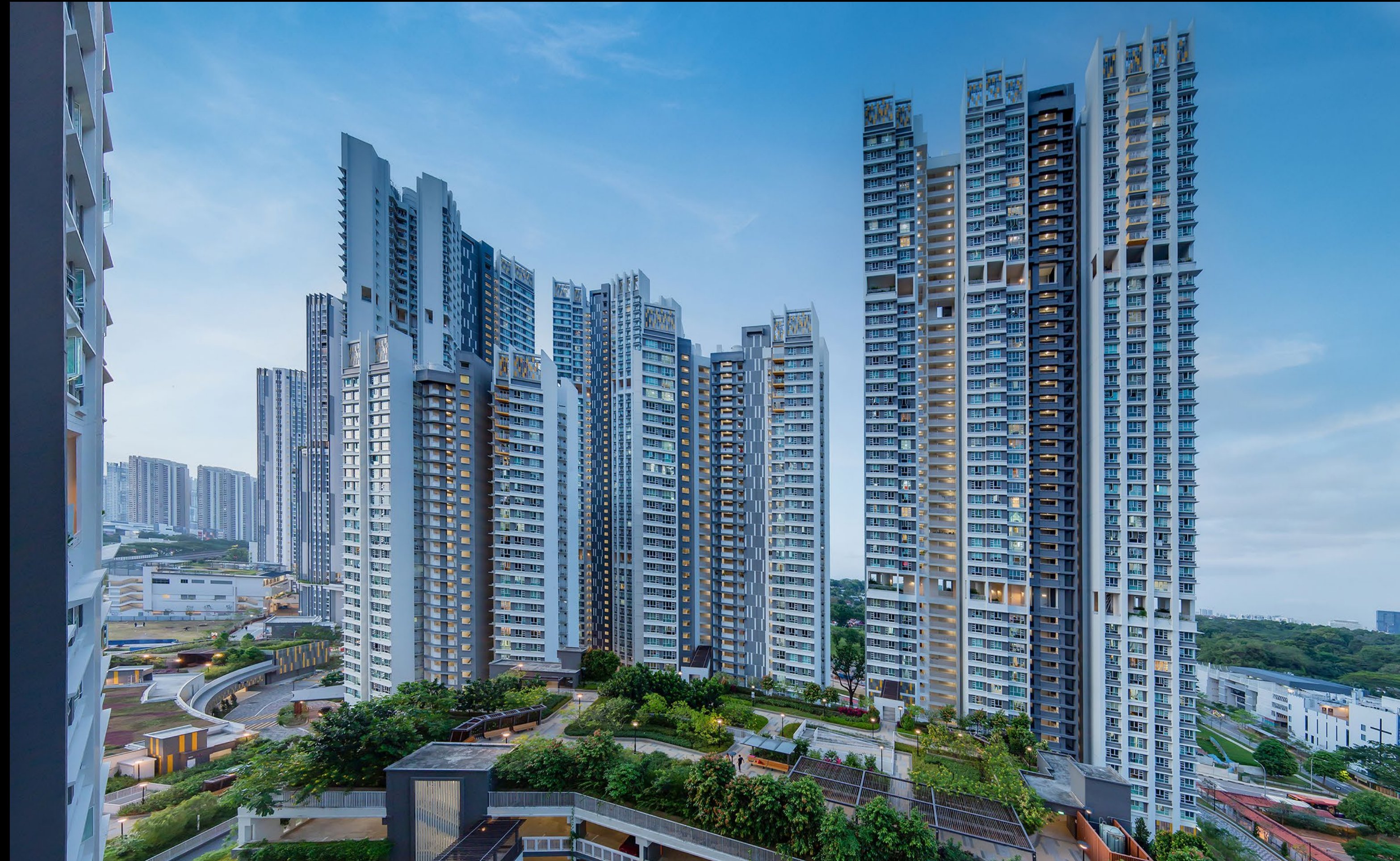
Residential blocks are designed with varying tower heights to break the monotony of the urban skyline, creating a welcoming urban relief with seamless connection with the linear park and its surroundings

The development offers a total of 1,192 residential units with convenient access to a range of amenities such as an eatery, a mini-mart, a selection of shops and a childcare centre. It comprises 6 residential blocks and features a multi-storey car park interconnected with a single-storey basement car park. A series of landscaped greenery at various levels terminates at an interesting sloped playground built into the side of the amenity building.