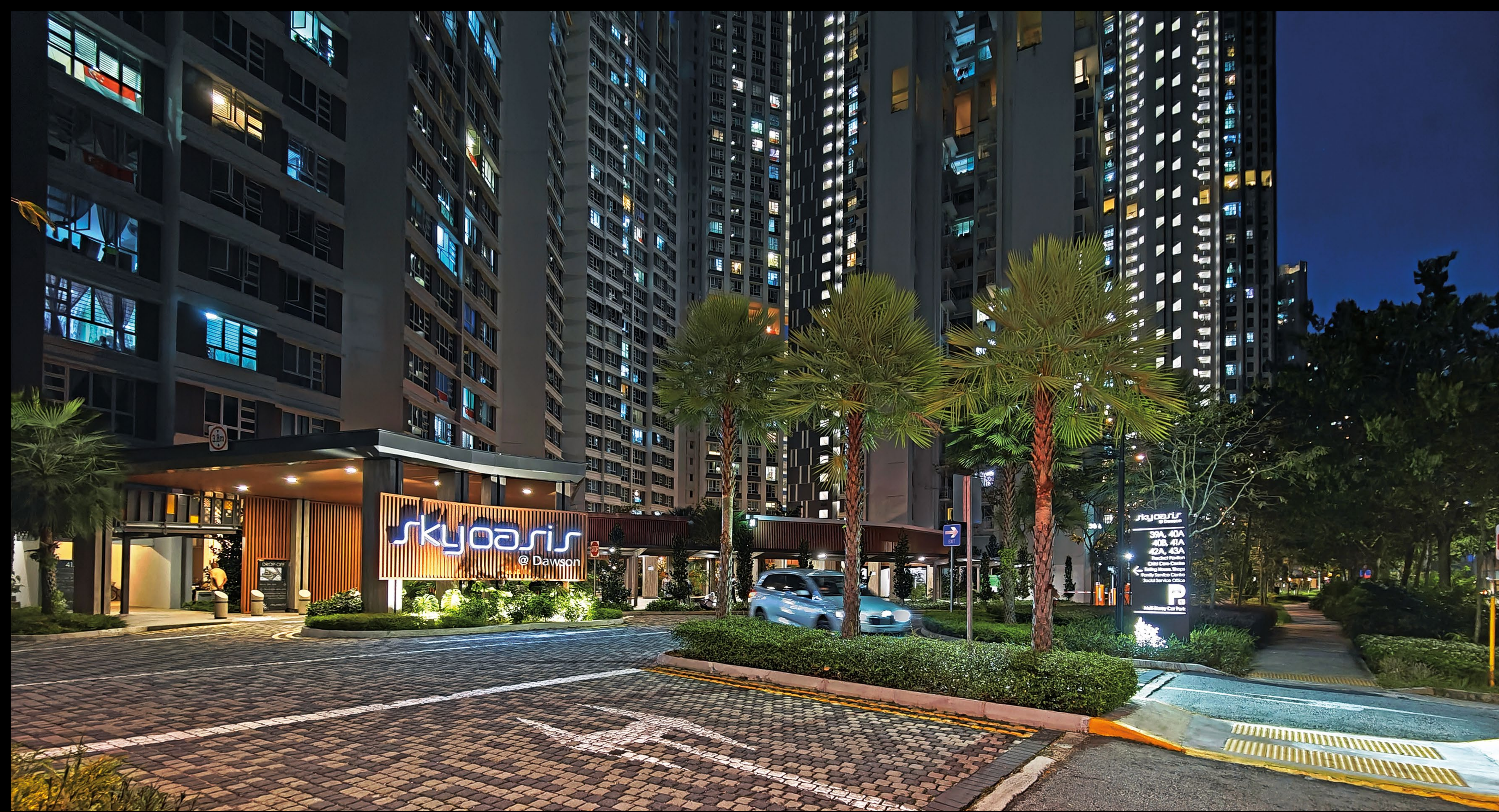
An inviting entrance and drop-off porch that exudes a resort-like ambiance, welcoming residents to an oasis of calmness