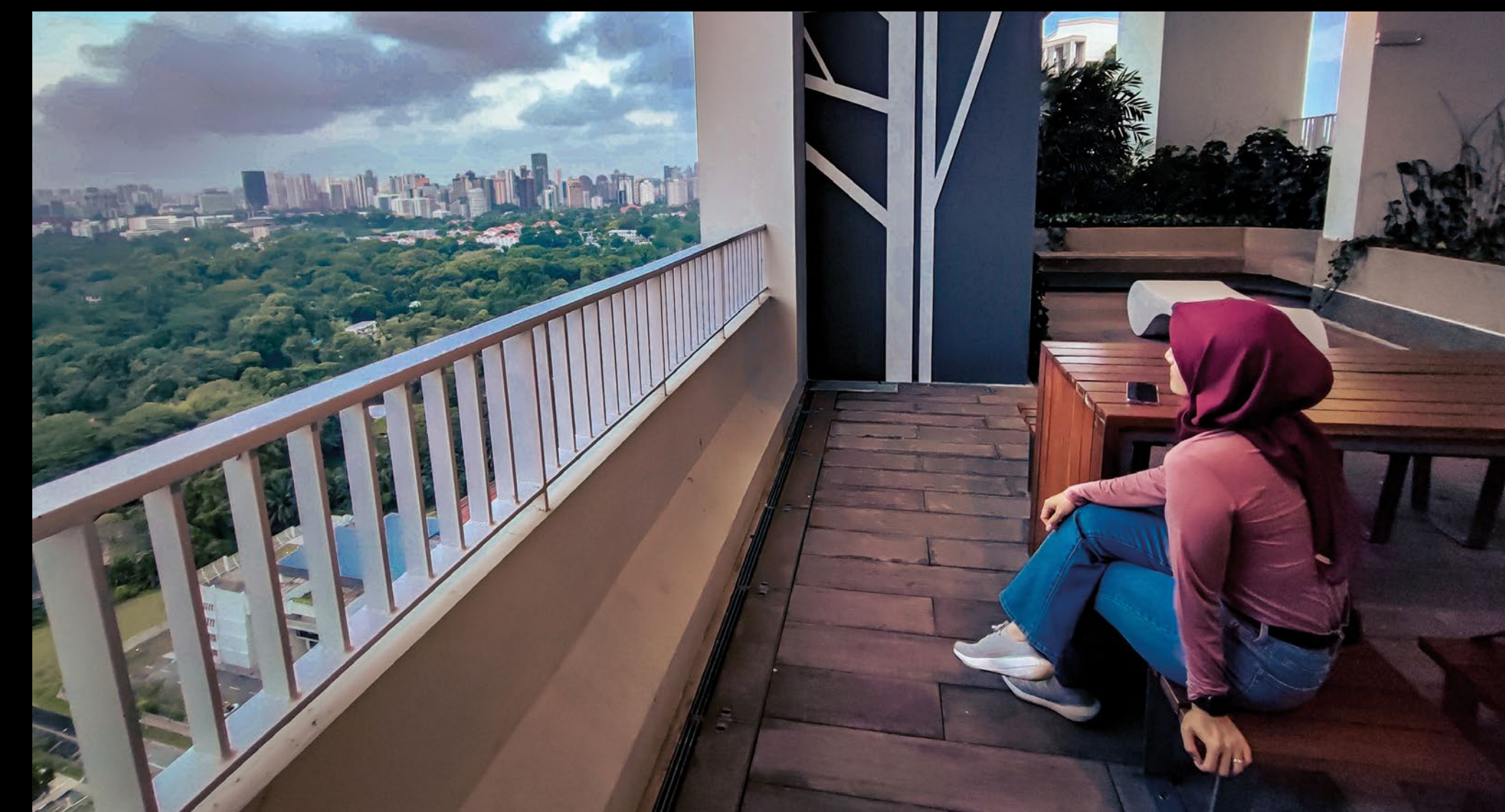
Serene community living room with scenic botanical garden view, a sky oasis from a busy city life