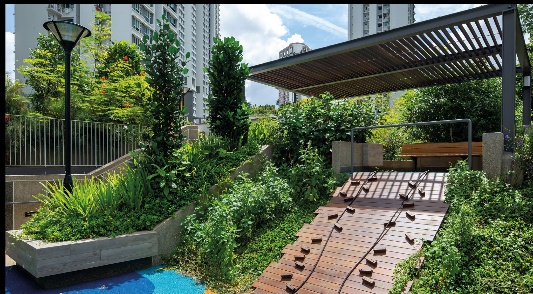
Children playground integrated into sloping landscape