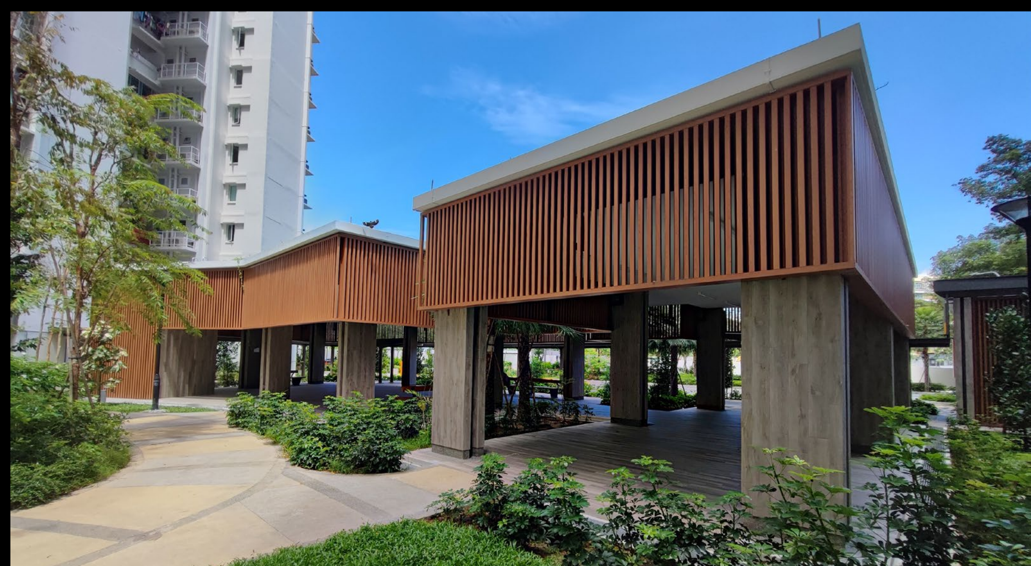
Intricate architectural details at precinct pavilion