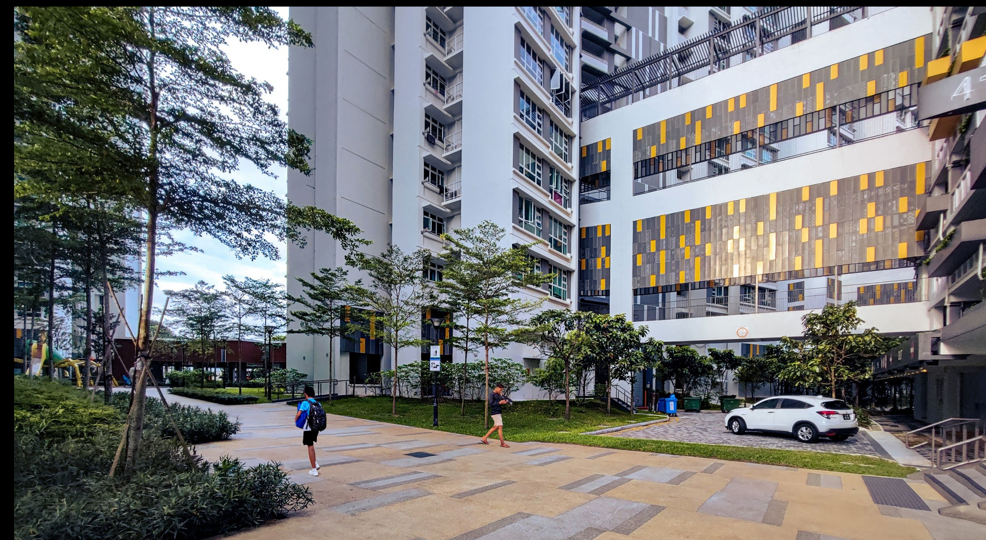
Maximising vehicular-free thoroughfares for residents to access precinct's green spaces

A central pedestrian thoroughfare, flanked by a wide selection of shops, guide residents from the residential blocks to the linear park and public transport nodes. Meticulous detail is also given to the design and execution of ground-level spaces, such as pavilions and drop-off porches. The different levels within the development are integrated with play equipment to encourage play and exercise.